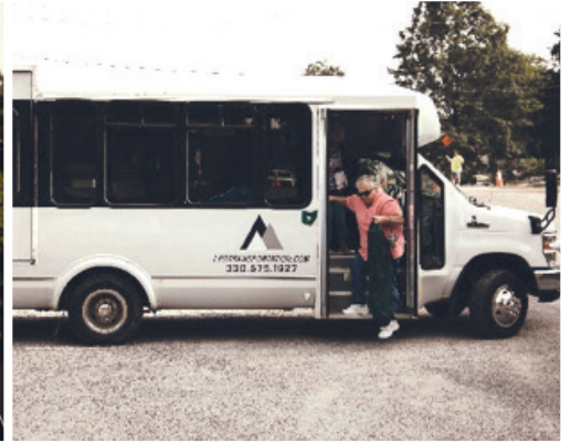
LED Transportation providing complimentary shuttle