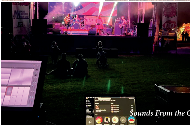
Sounds From the Cellar live on stage