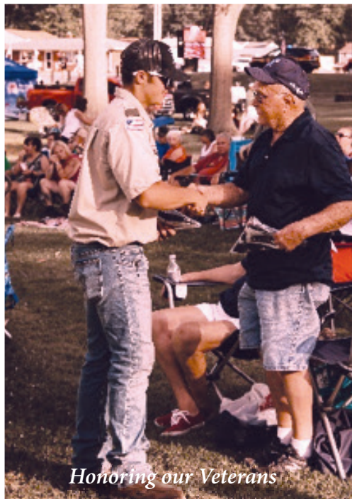
Honoring our Veterans