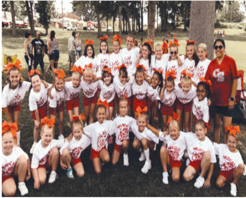
Canton South Youth Cheer