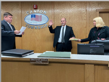
Oath of Office